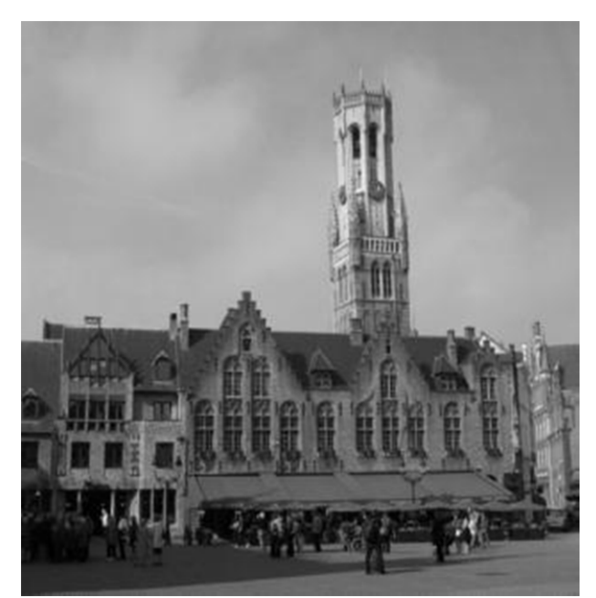
Fig 3. Experimental Image After Detection of Double Compressed Image IV CONCLUSION

10. C. Chen, Y. Q. Shi, and W. Su,(2008) [11] In this paper, Double JPEG compression detection is of significance in digital forensics. We propose an effective machine learning based scheme to distinguish between double and single JPEG compressed images. Firstly, difference JPEG 2D arrays, i.e., the difference between the magnitude of JPEG coefficient 2D array of a given JPEG image and its shifted versions along various directions, are used to enhance double JPEG compression artifacts. Markov random process is then applied to modeling difference 2-D arrays so as to utilize the secondorder statistics. In addition, a thres holding technique is used to reduce the size of the transition probability matrices, which characterize the Markov random processes. All elements of these matrices are collected as features for double JPEG compression detection. The support vector machine is employed as the classifier. Experiments have demonstrated that our proposed scheme has outperformed the prior arts.